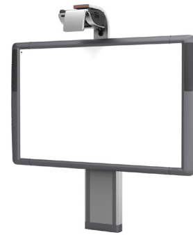
ActivBoard 300 Pro Adjustable with EST-P1 projector