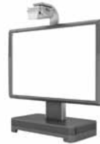
ActivBoard 500 Pro Mobile System with EST-P1 projector